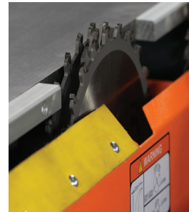
DADO STACK COMPATIBLE