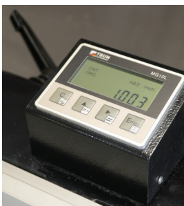
DIGITAL RIP FENCE READOUT