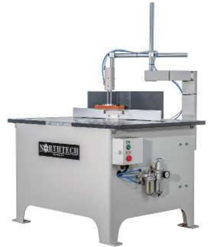
(Shown with optional hold down)