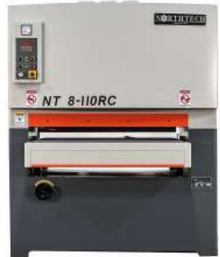
(NT 8-1100RC Shown for reference only)